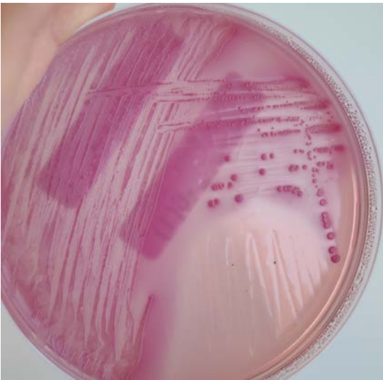
Figure 1. Typical appearance of E. coli on MacConkey agar supplemented with 1 mg/L cefotaxime.

10 \mu L plated to confluent growth (sample A)